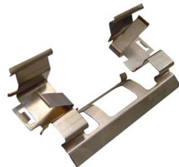
Caliper Hardware (Caliper Abutment Clip)