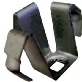
Hardware : A-431-S

Visit our Web Site http://www.anstroinc.com