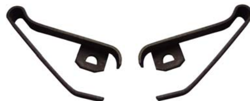
Hardware: A-387-LH, A-388-RH

Visit our Web Site http://www.anstroinc.com