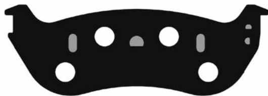
Plates: D1109-LORI USE D981-OLM