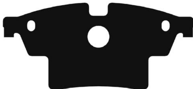
Shim: A-5089-CLVT Inner

Shims with CLVT suffix designates Custom Fit Tabbed Shims.