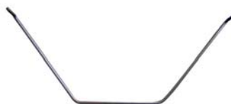
Pad Spreader Spring IBI Part Number: 23711

Visit our Web Site http://www.anstroinc.com