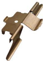
Caliper Hardware (Anti-RattleClip) Anstro Part Number: A-8254-S, A-8254-SR IBI Part Number: 23709, 23709Q