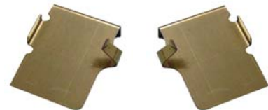
Caliper Hardware (Caliper Abutment Clip) Anstro Part Number: A-8252-S, A-8253-S A-8252-SR, A-8253R IBI Part Number: 23707, 23708 23707Q, 23708Q