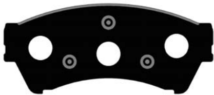
Plate: D1192-OUTER-MECHANALOK D1192-OUTER

Shims with RRST suffix designates Custom Fit Tabbed Shims.