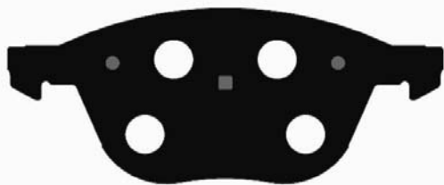
Plates: D1230-INNER Use D1044-INNER