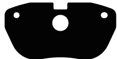
Shims: A-4583-CL A-4583-CLS