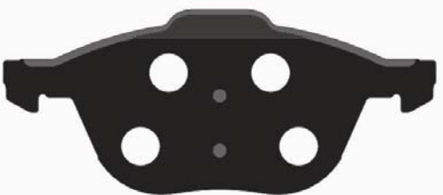
Plates: D1230-OUTER Use D1044-OUTER