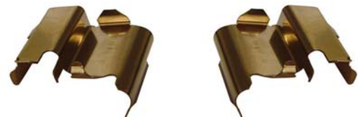
Caliper Hardware (Caliper Abutment Clip) Anstro Part Number: A-8117-S, A-8117-SR A-8118-S, A-8118-SR IBI Part Number: 22303, 22303Q 22304, 22304Q

Visit our Web Site http://www.anstroinc.com Caliper Hardware can be purchased through IBI Contact: Jean Sroufe 419-993-8140