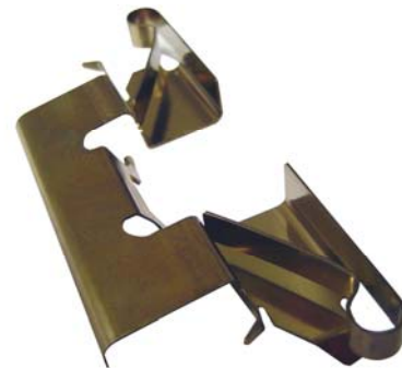
Caliper Hardware (Caliper Abutment Clip)