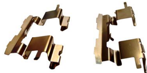
Caliper Hardware (Abutment Clip) IBI Part Number: 23408, 23408Q 23409, 23409Q

Visit our Web Site http://www.anstroinc.com