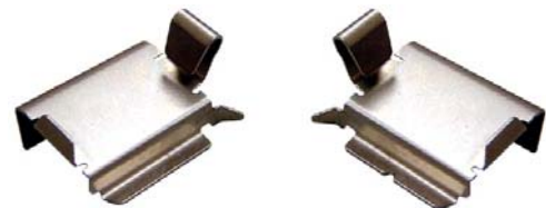
Caliper Hardware : (Abutment Clip)

Anstro Part Numbers: A-8233-S, A-8234-S A-8233-SR, A-8234-SR IBI Part Numbers: 23472, 23472Q 23473, 23473Q