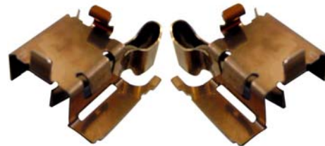
Caliper Hardware (Abutment Clip)

Anstro Part Number: A-8297-S, (24071) A-8298-S, (24072) (IBI Part Number)