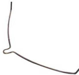
Pad Spreader Spring IBI Part Number: 23969