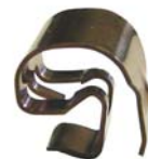
Anstro Part Number: A-8267-S IBI Part Number: 23836