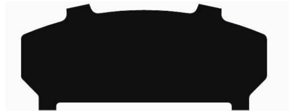
Shim: A-5206-CLVT Anstro Mfg.

Visit our Web Sites http://www.anstroinc.com http://www.ibilima.com