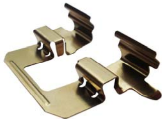
Caliper Hardware (Abutment Clip)

Anstro Part Number: A-8300-S, (24074) (IBI Part Number)