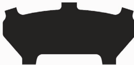
Shim: A-5205-CLVT Anstro Mfg.