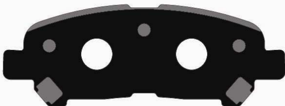
Plate: D1325 Gunn Metal