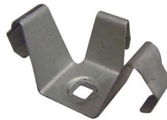
Hardware: A-264-S Anstro Mfg.

Visit our Web Sites http://www.anstroinc.com http://www.ibilima.com