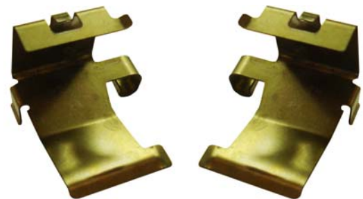
Caliper Hardware (Abutment Clip)

Anstro Part Number: A-8263-S, (24091) A-8264-S, (24092) (IBI Part Number)