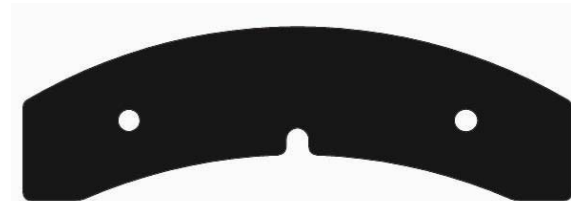
Shim: A-5209-CL Anstro Mfg.