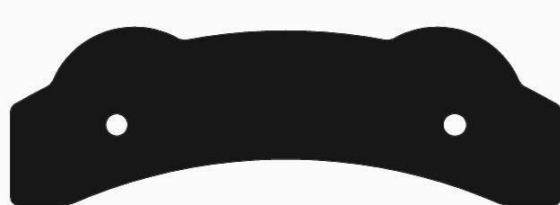
Shim: A-5096-CL Anstro Mfg.