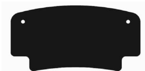
Shim: A-5220-CLSD Anstro Mfg.