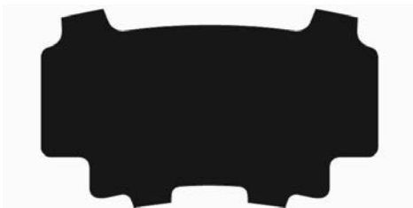
Shim: A-5219-CLVT Anstro Mfg.