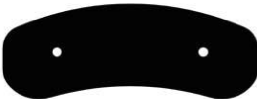
Shim: A-4834-CL Anstro Mfg.

Anstro Part Number: A-8304-S, (24098) A-8305-S, (24099) (IBI Part Number)