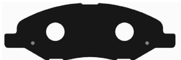
Plate: D1345-Inner Gunn Metal