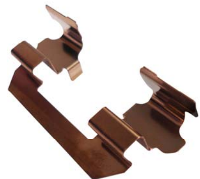
Caliper Hardware (Abutment Clip) Anstro Part Number: A-8325-S, (24153) (IBI Part Number)