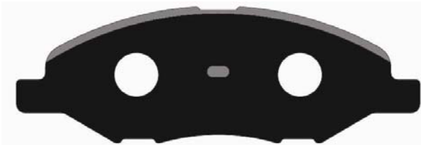
Plate: D1345-Outer Gunn Metal