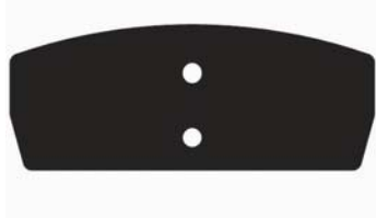
Shim: A-5252-CL Anstro Mfg.