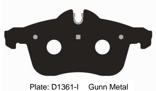
Plate: D1361-I Gunn Metal