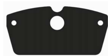
Shim: A-5251-CL Anstro Mfg.