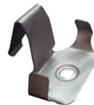
Hardware: A-266-S Anstro Mfg.

Visit our Web Sites http://www.anstroinc.com http://www.ibilima.com