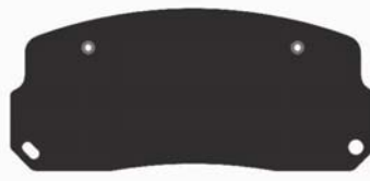
Shim: A-5216-CLSD Anstro Mfg.

Anstro Part Number: A-8328-S, (24177) (IBI Part Number)