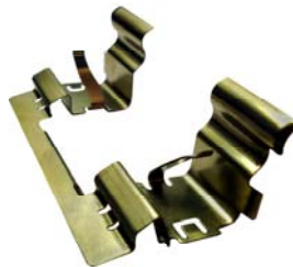
Caliper Hardware (Abutment Clip)

Anstro Part Number: A-8328-S, (24177) (IBI Part Number)