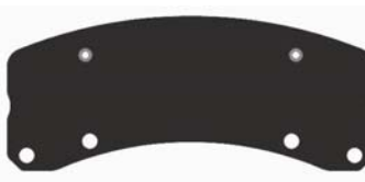
Shim: A-4741-CLSD Anstro Mfg.