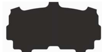
Shim: A-5110-CLVT Anstro Mfg.