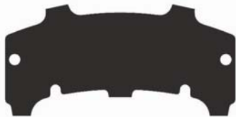
Shim: A-5111-CLVT Anstro Mfg.