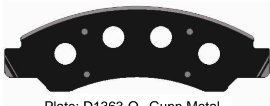
Plate: D1363-O Gunn Metal Use D1092-O Gunn Metal