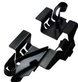
Caliper Hardware (Abutment Clip)

Anstro Part Number: A-8326-S, (24178) (IBI Part Number)