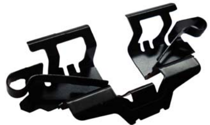
Caliper Hardware (Abutment Clip)

Anstro Part Number: A-8326-S, (24178) (IBI Part Number)