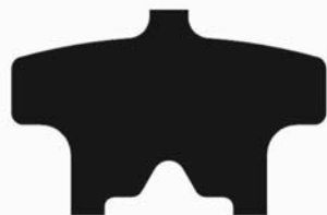
Shim: A-5245-CLVT Anstro Mfg.