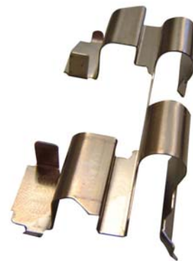
Caliper Hardware (Abutment Clip) Anstro Part Number: A-8244-S, (23698) (IBI Part Number)

Visit our Web Sites http://www.anstroinc.com http://www.ibilima.com