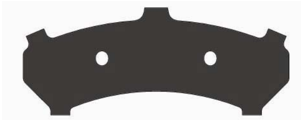
Shim: A-5310-CLVT Anstro Mfg.