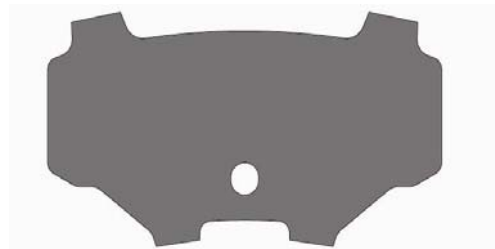
Shim: A-5219-CLVT Anstro Mfg. (Revised)