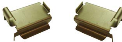
Caliper Hardware (Abutment Clip)

Anstro Part Number: A-8306-S, (24100) A-8307-S, (24101) (IBI Part Number)