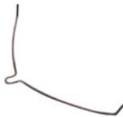
Caliper Hardware (Pad Spreader) 22022 (IBI Part Number)