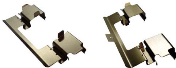
Caliper Hardware (Abutment Clip) Anstro Part Number: A-8280 (23989) A-8281-S, (23990) (IBI Part Number)