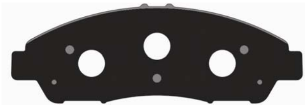
Plate: D1378-IL Gunn Metal Plate: D1378-IR Plate: D1378-O