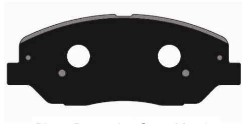
Plate: D1384-I Gunn Metal