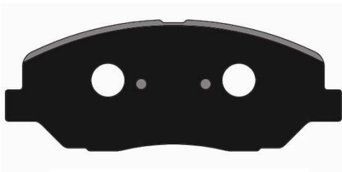
Plate: D1384-O Gunn Metal