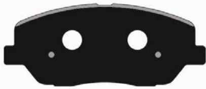
Plate: D1385-O Gunn Metal