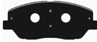
Plate: D1385-I Gunn Metal