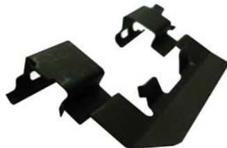
Caliper Hardware (Abutment Clip)

Anstro Part Number: A-8334-S, (24235) (IBI Part Number)