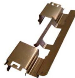
Caliper Hardware (Abutment Clip) Anstro Part Number: A-8199-S, (23287) (IBI Part Number)

Visit our Web Sites http://www.anstroinc.com http://www.ibilima.com