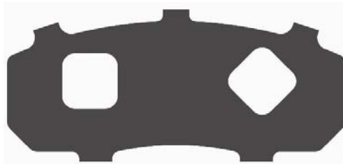
Shim: A-5355-CLVT Anstro Mfg.