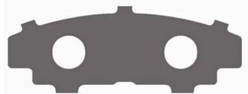
Shim: P/N A-5231-CLVT Inner & Outer Anstro Mfg.