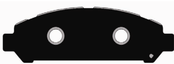
Plate: D1401-IR Gunn Metal