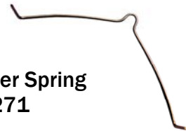
Hardware: Pad Spreader Spring IBI P/N 24271