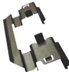
Caliper Hardware: Abutment Clip Anstro Mfg. P/N A-8338-S IBI P/N 24269

Visit our Web Sites http://www.anstroinc.com http://www.ibilima.com