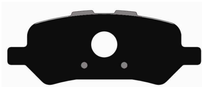
Plate: D1402-O Gunn Metal