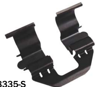
Caliper Hardware: Abutment Clip Anstro Mfg. P/N A-8335-S IBI P/N 24268

Visit our Web Sites http://www.anstroinc.com http://www.ibilima.com