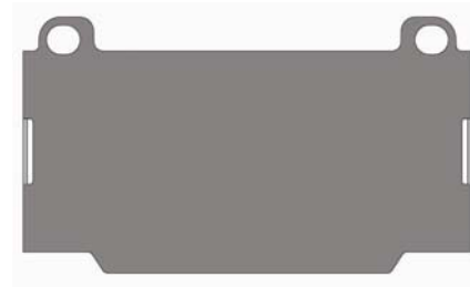
Shim: A-5393-CLVT Inner & Outer Anstro Mfg.