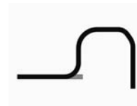
Sensor: A-527-RH Anstro Mfg.

Visit our Web Sites http://www.anstroinc.com http://www.ibilima.com