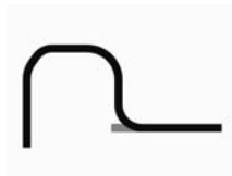
Sensor: A-526-LH Anstro Mfg.