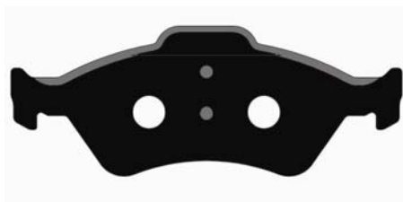
Plate: D1200 - Outer Gunn Metal