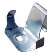
Piston Clip: A-523-S Anstro Mfg.

Visit our Web Sites http://www.anstroinc.com http://www.ibilima.com