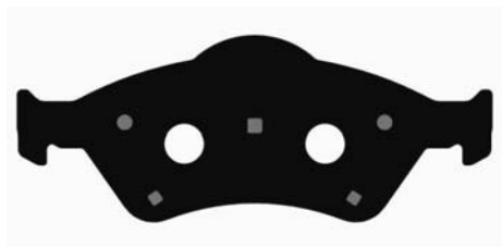
Plate: D1200 - Inner Gunn Metal