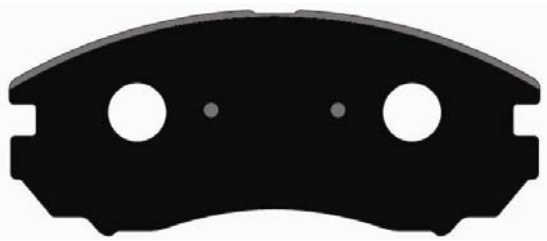
Plate: D1408-Inner Gunn Metal