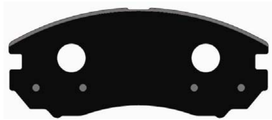
Plate: D1408-Outer Gunn Metal