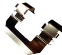
Caliper Hardware: Abutment Clip IBI P/N 23501

Visit our Web Sites http://www.anstroinc.com http://www.ibilima.com