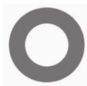
Crescent Washer: A-104-W Anstro Mfg.