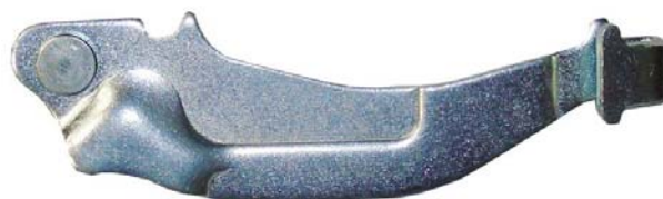
Lever: A-6078-LH Assembly Anstro Mfg.