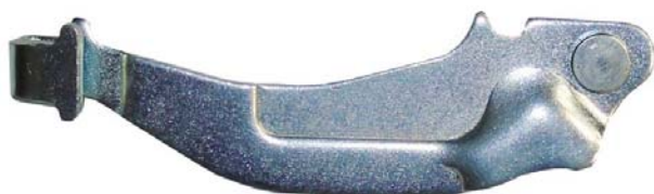
Lever: A-6079-RH Assembly Anstro Mfg.