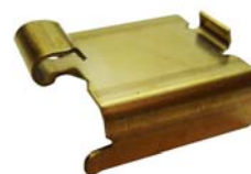
Caliper Abutment Clip: Expected To Be: Anstro Mfg. A-8303-S IBI 24094

Visit our Web Sites http://www.anstroinc.com http://www.ibilima.com