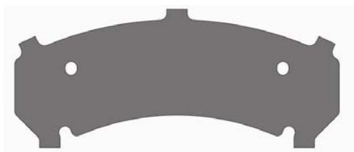
Shim: A-5339-CLVT Anstro Mfg.