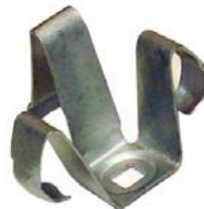
Piston Clip: A-497-S Anstro Mfg.

Visit our Web Sites http://www.anstroinc.com http://www.ibilima.com