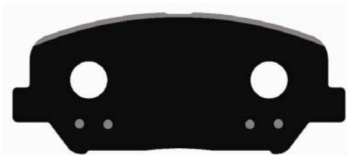
Plate: D1413-Inner Gunn Metal