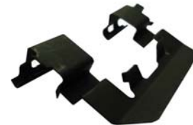
Abutment Clip: A-8349-S Anstro Mfg. 24340 IBI

Visit our Web Sites http://www.anstroinc.com http://www.ibilima.com