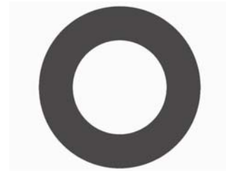
Crescent Washer: A-104-W Anstro Mfg.