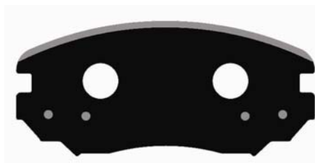
Plate: D1421-Inner Anstro Mfg.