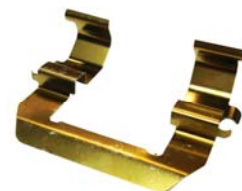
Abutment Clip: A-8348-S Anstro Mfg. 24320 IBI

Visit our Web Sites http://www.anstroinc.com http://www.ibilima.com