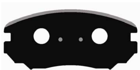
Plate: D1421-Outer Anstro Mfg.

Application: 2010 Buick Lacrosse (Front)