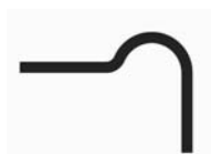
Sensor: A-553-S Anstro Mfg.