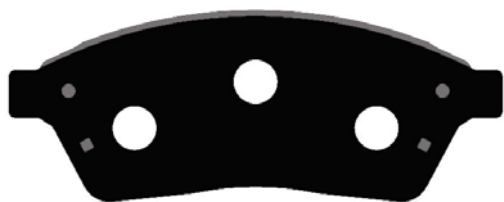
Plate: D1422-Inner Gunn Metal