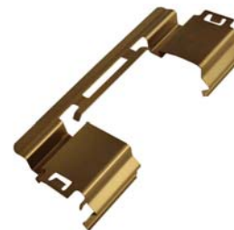
Caliper Abutment Clip: A-8354-S Anstro Mfg. 24357- IBI

Visit our Web Sites http://www.anstroinc.com http://www.ibilima.com